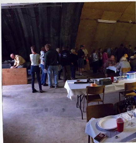
A phenomenal success!