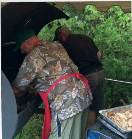
Cooking up a storm!