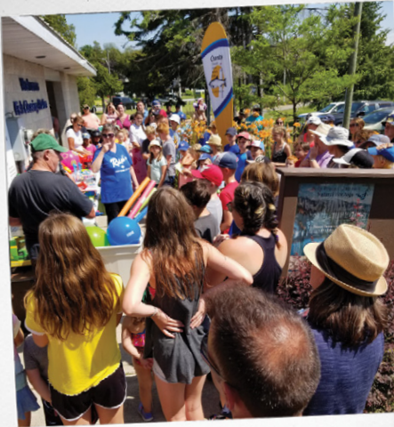
Activity on Kid's Day at the Saugeen Shores Weigh Station. We had over 170 kids fishing between the 5 weigh stations on Kid's Day. Great fun!

Some of the action during our Chantry Derby!