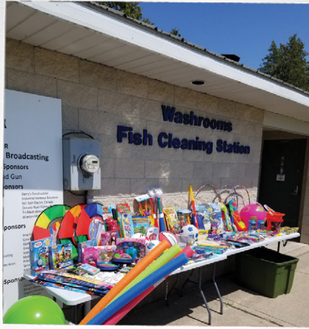
Kid's Day was held at the Pike Bay, Wiarton, Saugeen Shores, Kincardine weigh stations and at a special weigh in set up at Sauble River that day. Every kid earned a prize, a hotdog and a drink.